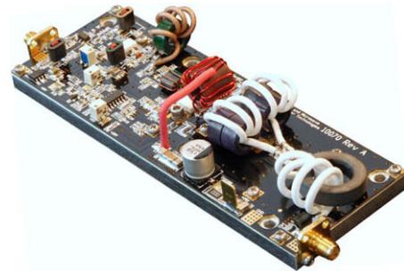
Shown with optional SMA connectors.

The HD30845 is a high gain Class A/AB amplifier designed specifically for the 81.36MHz ISM band. It is ideal as a driver stage in industrial, commercial or scientific systems. It utilizes a combination of three active device technologies for optimum performance and ruggedness.