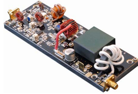
Shown with optional SMA connectors.

The HD30672 is a high gain Class AB amplifier designed specifically for the 27.12MHz ISM band. It is ideal as a driver stage in industrial, commercial or scientific systems. It utilizes a combination of three active device technologies for optimum performance and ruggedness.